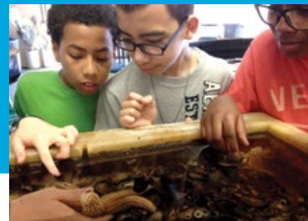
A day with RI EPSCoR includes exploring the creatures and ecosystem of the salt marsh at Jamestown's Fort Getty (left and middle photos) and learning about marine life at the URI Marine Science Research Facility.

Additionally, the STEM focus and the exposure to college campuses give students genuine insight into what might be possible.