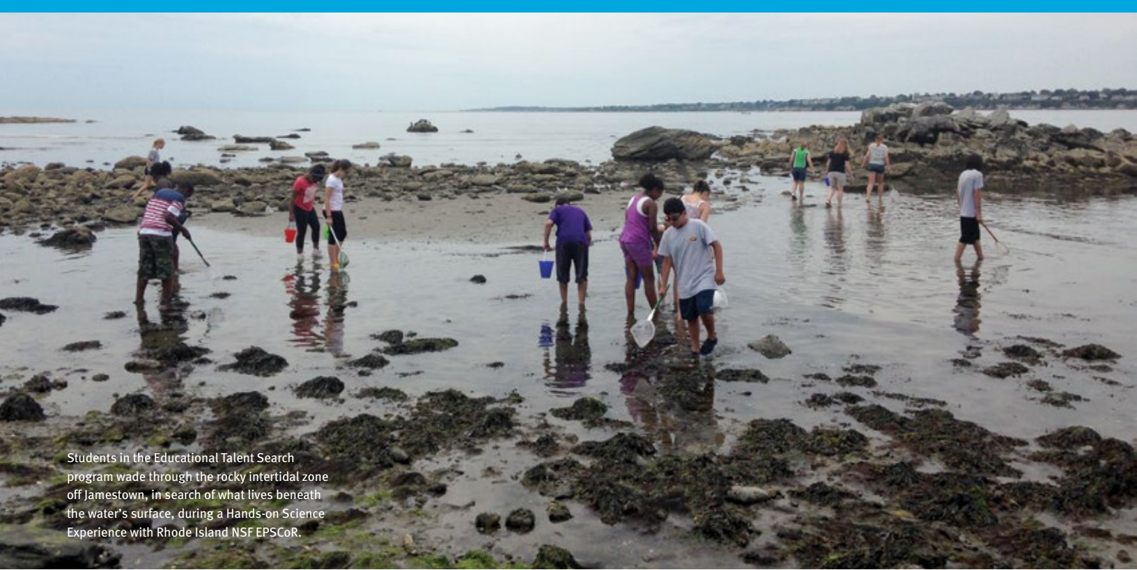
Students in the Educational Talent Search program wade through the rocky intertidal zone off Jamestown, in search of what lives beneath the water's surface, during a Hands-on Science Experience with Rhode Island NSF EPSCoR.