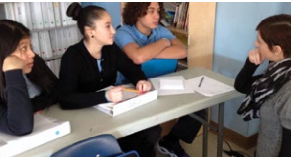
A class of 8th graders at The Learning Community in Central Falls engage in The South POLE project.