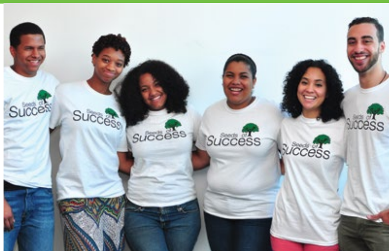
The College of Environment and Life Sciences Seeds of Success program offers guidance, resources, and opportunities to help students establish a firm footing.

Similarly, working within the College of the Environment and Life Sciences (CELS) at the University of Rhode Island, Seeds of Success (SOS) focuses on student-run initiatives to provide the academic, social and professional guidance that often determine an undergraduate's success.