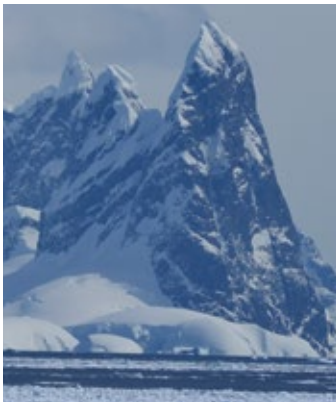
Antarctica scenery, including, far right, the view from Palmer Station with Anvers Island in the background.

The region surrounding the Western Antarctic Peninsula is experiencing some of the most rapid climate change with an increase in temperature five times the global average. With cold temperatures that last year-round, animals in this area already face an increased risk as they experience little natural variability and are ill equipped to handle a new, changing environment.