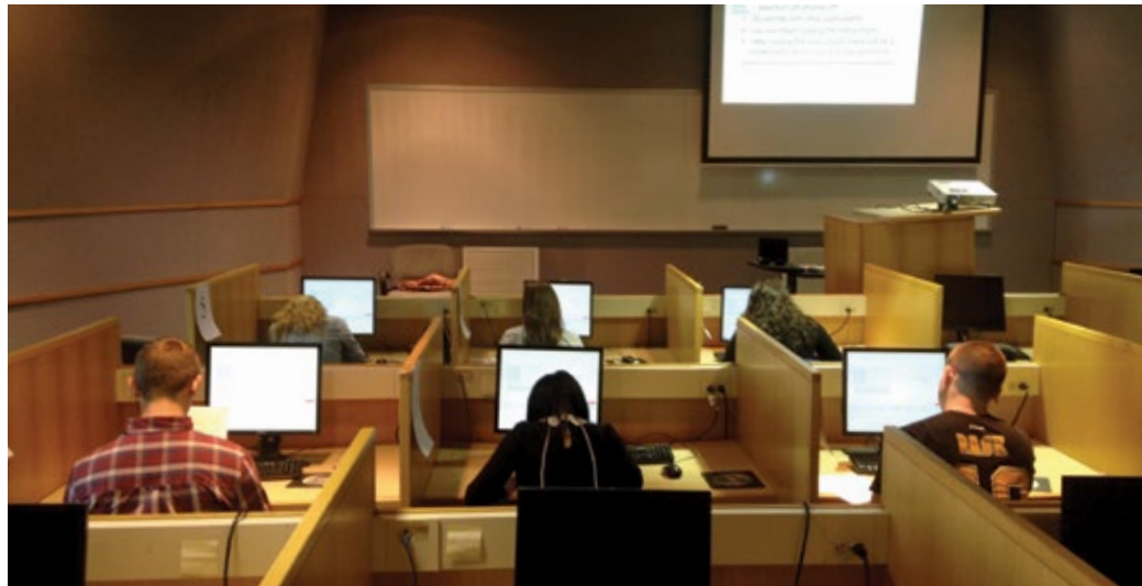
Study subjects consider information and make decisions as part of a research experiment at the University of Rhode Island.

One of the challenges, however, stems from the fact that there are yet few applications of such experiments in the realm