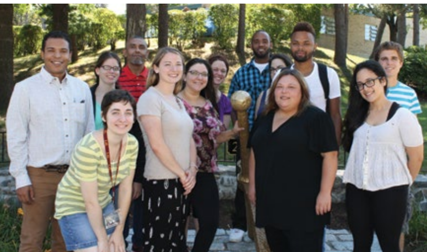
The Rhode Island College Learning 4 Life program pairs students with a network of trained peers to provide support and ensure successful completion of an undergraduate degree.

“What really ends up happening at the retreat is we identify (continued on p 23)