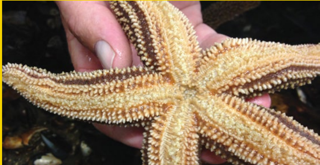
A handful of sea stars rescued about five years ago after being stranded by the outgoing tide still live today at the Marine Science Research Facility on URI's Narragansett Bay Campus.

Balancing act: Sea stars in many marine ecosystems represent the largest biomass of all benthic animals. They have a big influence on the ecosystem, with a diverse diet that ranges from microalgae and sponges to snails and bivalves like mussels, clams and oysters. There has been a profound die-off of sea stars on both the northeast and west coasts, causing considerable alarm among marine biologists.